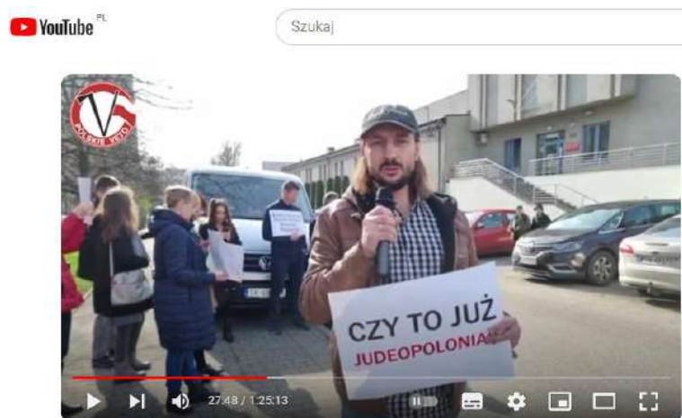
STOP CENZURZE - pikietą pod Instytutem Pamięci Narodowej w Katowicach. Wspieramy Wydawnictwo 3DOM.