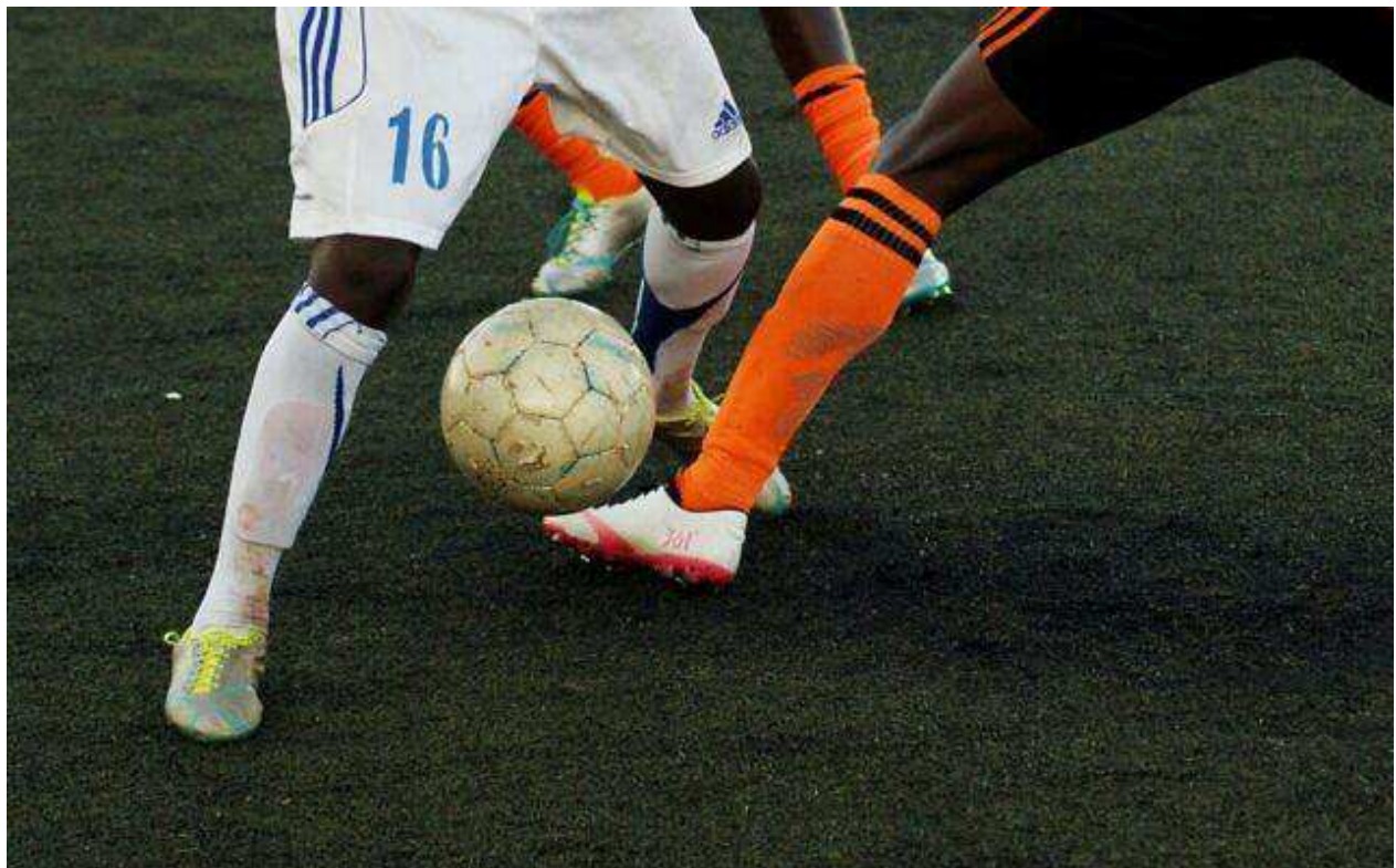
Football

A senior Polish football referee sparked dismay after responding to a campaign launched to counter antisemitism in football stadiums across Europe by claiming the initiative was “just another utter balderdash spun by Jewish centres and milieus – one knows very well for what purpose. ”