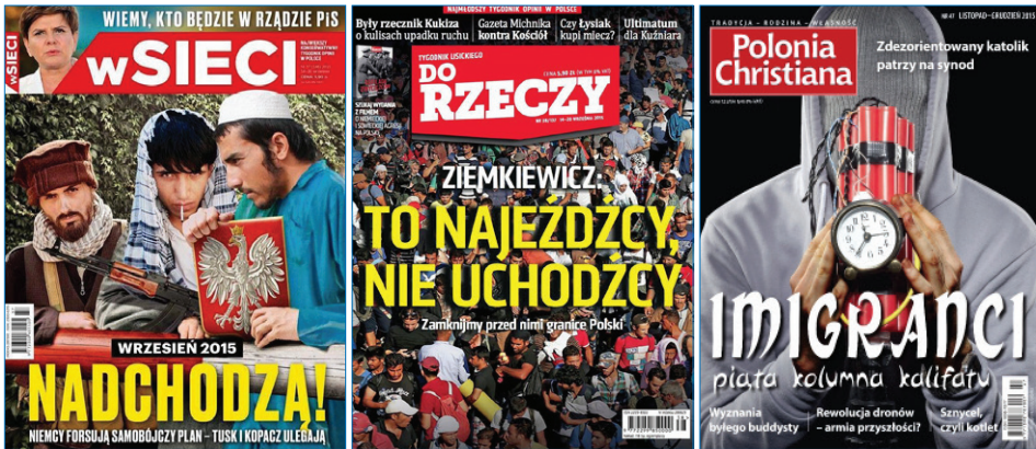
Figure 1: Covers of weeklies W Sieci ("They are coming") and Do Rzeczy ("They are invaders not refugees") and the bimonthly Polonia Christiana ("Immigrants - Caliphate's Fifth Column").

All these covers and many other similar images and statements made by the key politicians in the country resulted in the serious exaggeration of the threat and had also significant impact on the perception of the size of the Muslim community in the country. In line with the Thomas's theorem ("If men define situations as real, they are real in their consequences") – Poles defined the supposed inflow of Muslim as real although in reality it was not taking place, and thus produced significant increase of the size of Muslim population that was totally imaginary. The theorem suggests also that it is not only our thoughts that are affected by our perception of the social reality but also our deeds. The interpretation of a situation in the country as the "Muslim invasion" and attack on "our culture or our way of life" quickly caused also certain supposedly "defensive actions" (see below subchapter Verbal and Physical Attacks).