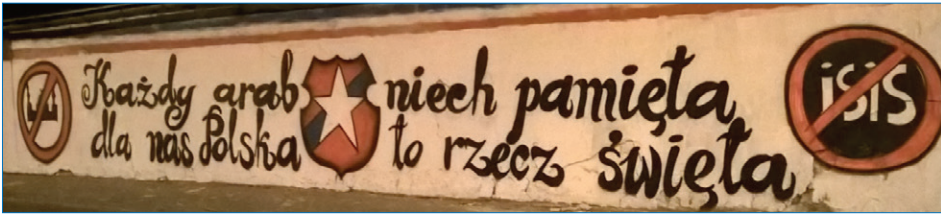
Figure 2: Graffiti by the football fans of Wisła Kraków in one of the districts of Kraków stating “Every arab 33 (sic) should remember that for us Poland is sacred”.