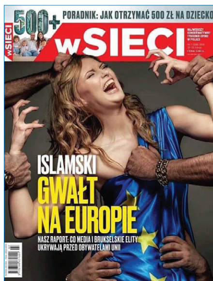
Figure 3: February 2016 cover of the magazine W Sieci - “The Islamic Rape of Europe”.

went on to say, “The first signs that things were going wrong, however, were there a lot earlier. They were still ignored or were minimised in significance in the name of tolerance and political correctness.” The February edition of the magazine also carried articles headlined “Does Europe Want to Commit Suicide?” and “The Hell of Europe” dealing with the issues of the so-called “refugee crisis” and its consequences. 38 This type of narrative was strengthened by more nuanced articles by central and left-wing mass media outlets, which however maintained the same “clash of civilization” and anti-Muslim logic. Importantly they were also strengthened by the statements of the country’s key politicians. The Minister of Foreign Affairs Witold Waszczykowski wrote a letter to his German counterpart demanding information whether there were Polish women among the victims of the attacks. Earlier in a TV interview commenting on the New Year’s Eve attacks he argued that the so-called “refugee crisis” has been used by the DAESH and other terrorist organisations “to fight with our civilisation on our land”. 39