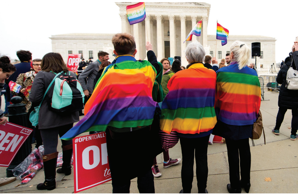
Supporters of LGBTQ+ equality outside the United States Supreme Court on Dec. 5, 2017, the morning of oral arguments in the Masterpiece Cakeshop v. Colorado Civil Rights Commission .