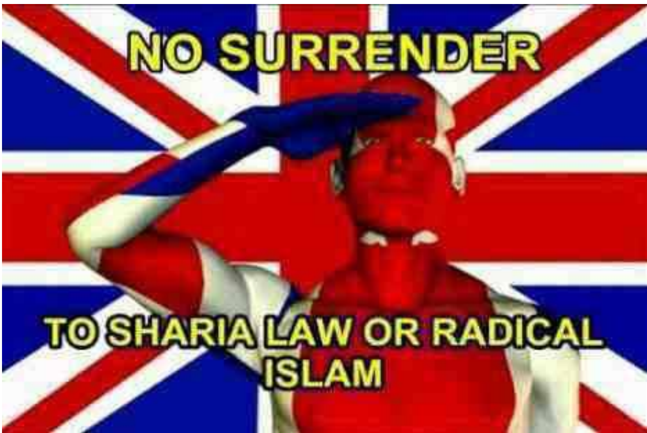
In the UK, the EDL and Casuals United have emerged as pro-war movements that claim to speak for our 'heroes' in Afghanistan and Iraq.

increase in racist incidents involving the armed forces; the Munich First Squad was investigated after allegations that right-wing behaviour was rife.