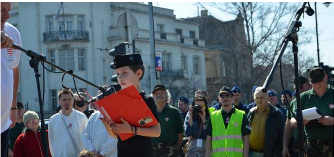
The next generation in Hungary are being indoctrinated into the politics of anti-Roma hatred.

In choosing to locate themselves in rural areas,