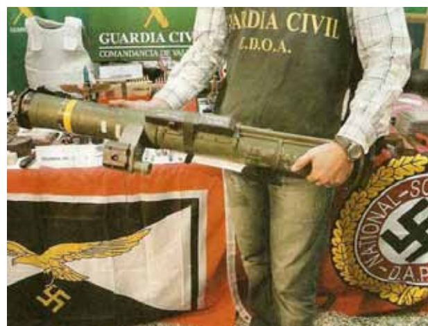
Some of the weapons and other items seized during the Operation Panzer investigation into the neo-Nazi scene in Valencia.