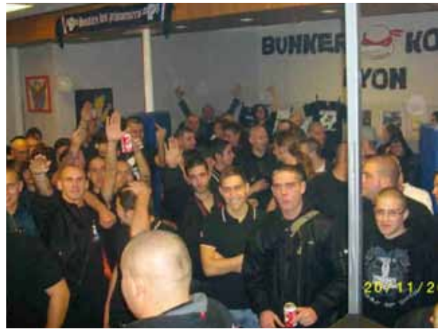
Lyons far-right activists have been linked to Blood & Honour.

The decision to re-launch the Polish version of Redwatch came after a Blood & Honour rally. And members of the Blood & Honour division Bohemia, as well as Combat 18 were amongst those arrested in the March (see page 13) coordinated raids on neo-Nazis in the Czech Republic with the Organised Crime Detection Unit now linking those arrested to plans to launch attacks on buildings and individuals. Blood & Honour also seem to have formed cells in France, where the Lyons branch of Blood & Honour (better known as the Lyons Dissenters) were linked, alongside the Lyons branch of the National Identity League (now known as Rebeyne) to several nasty attacks on anti-fascists. 123 (see page 16). And Blood & Honour has also opened its first branch in Italy, having previously been represented by the Veneto Fronte Skinheads, which has been active since 1986. According to Searchlight , Blood & Honour have taken over the office of the neo-Nazi SPQR Skin, describing themselves as the ‘Italian