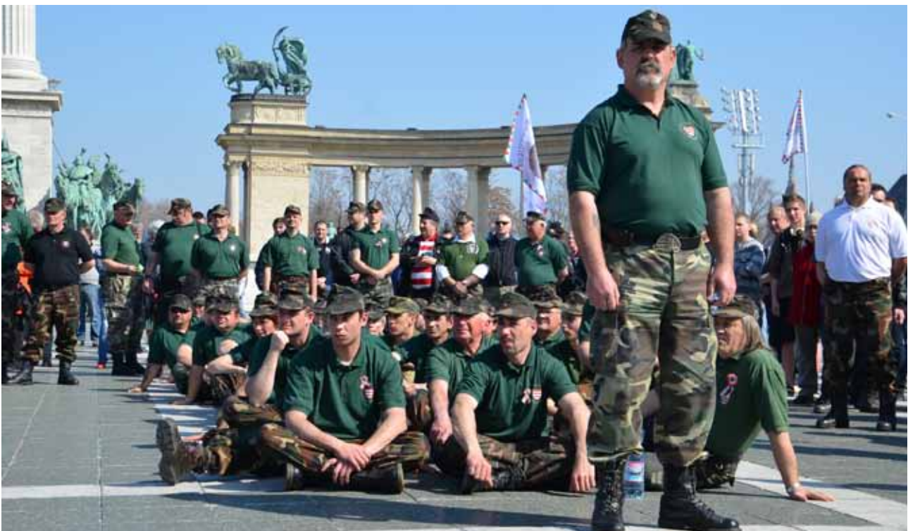
17 March 2012 – an initiation ceremony in Budapest's Heroes Square for new recruits to the Hungarian Guard.

Hungary: Jobbik went further than this in 2007 to form its own private militia, the Hungarian Guard ( Magyar Gárda ), 129 which was soon compared to the Arrow Cross, Hungary's Second World War fascist militiamen, who collaborated with the Nazis in killing tens of thousands of Hungarian Jews. This first attempt by Jobbik to form its own private militia was thwarted as the courts declared it illegal and banned it on the grounds that its militaristic demonstrations generated ethnic tensions and constituted a threat to public order. 130 Now a new paramilitary squad, the Civic Guard Association for a Better Future ( Szebb Jövőért