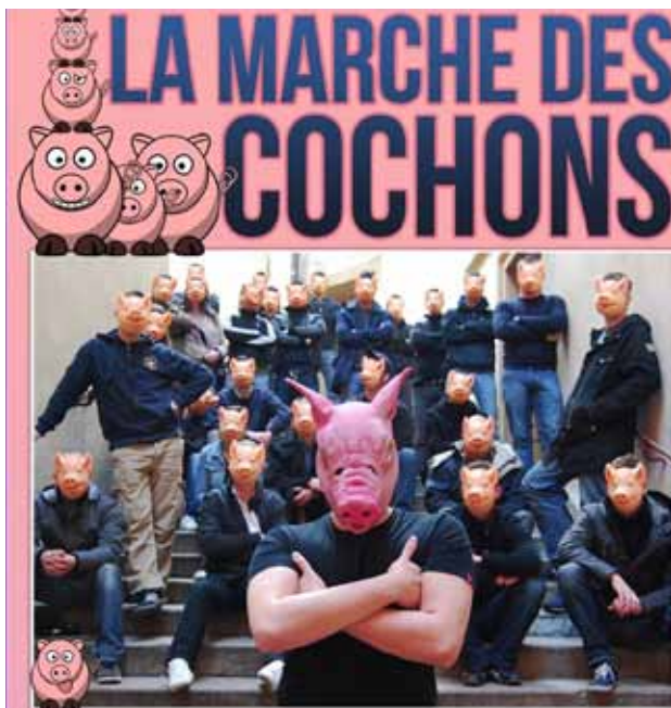
Across Europe, mosques are attacked, women are spat at and abused for wearing the hijab, and Muslims are regularly baited at events like the 'march of the pigs'.

There is an interplay between old and new forms of far-right activity, with the NPD seemingly dependent on the AN – which is more systematic in its collection of information on political enemies – to organise and mobilise supporters on the streets. And the NPD jealously guards its hegemony, as evidenced by the fact that it has set up an Institute for Homeland and National Identity and has made links with CasaPound Italia to explore ways to construct a 'cultural revolution from the right'. 163 Despite its attempts to re-brand itself