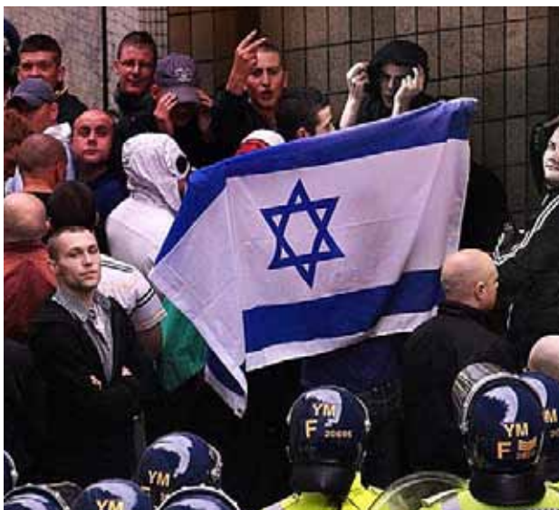
The English Defence League regularly sports Israeli flags at demonstrations and attacks those campaigning for Palestinian rights.

The EDL also targets (as the extreme Right did in the 1970s) trades unionists, anti-globalisation and anti-cuts movements, as well as those campaigning for Palestinian rights. In June 2010, the Palestine Solidarity Campaign stall in Birmingham was attacked and