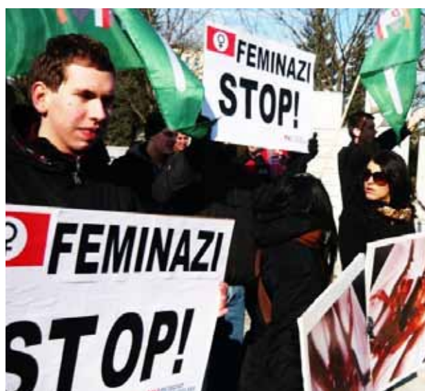
At an All-Polish Youth demonstration, protestors carry, amongst other things, pictures of aborted embryos.

Another issue being flagged up by researchers is that while women have always been active in the far Right, they are increasingly playing a more prominent role. This is most obvious in Germany where women now account for an estimated one in five neo-Nazis, but it was also flagged up in the Czech Republic where fifteen women have been accused of various offences, including raising funds for jailed neo-Nazi ‘prisoners of war’, arising from their association with the Resistance Women Unity (RWU), an offshoot of the National Resistance. ( Národní odpor – NO ). 180 Traditionally, women’s role within fascism was, in accordance with the Lebensborn , to bring up children and maintain the purity of the Aryan race. Researchers studying the role of girls and women in fascism in Germany today have noted the ‘Prussian rigidity with which mothers raise their children, glorifying discipline and the German tradition’. 181 But women also play an active role in far-right structures. A women’s organisation, the Ring of National Women ( Ring Nationaler Frauen – RNF ) was