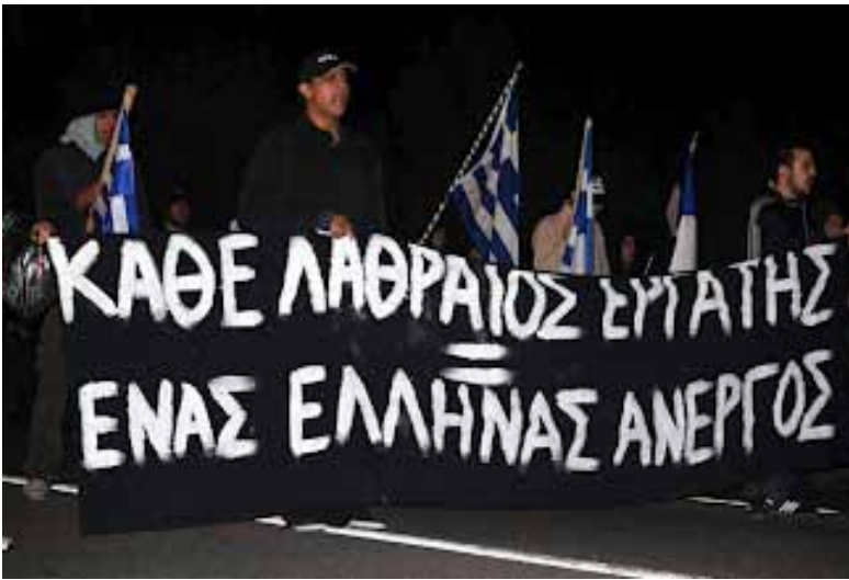
The Greek Popular Front demonstrate carrying a banner 'For every illegal immigrant – one Greek unemployed'.

with swastikas and the European Network Against Racism drew attention to the April 2010 attack on a building of the Palestinian community in Larnaca. 77 KEA refers to KISA as a 'social abscess' and 'a fifth column'.