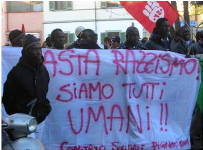
Demonstrators march near the Piazza Dalmazia marketplace, Florence after two Senegalese street vendors were shot dead by a far-right sympathiser in December 2011.

While nearly all the mainstream electoral extreme-right parties have moved away from classical anti-Semitism, expressing unqualified support for the state of Israel's occupation of the Palestinian territories and professing a new-found 'philozionism' (love of Zionism), 9 many (but by no means all) of these looser far-right networks are classical anti-Semites. They deny the Holocaust and seek to establish nationalistic narratives which omit the history of any collaboration with the Nazis and pogroms against the Jews in the period when the Third Reich dominated much of Europe. While the counter-jihadi network is first and foremost anti-Arab and anti-Palestinian, many of the more hard-core far-right groups we identify in this report believe that they have been betrayed by the pro-Israel extreme Right. As the case-studies demonstrate, this element of the far Right has stepped up its vitriol against Jews and attacks on Jewish targets. But despite a message - sometimes overt, sometimes by innuendo - that is decidedly anti-Semitic, the main targets of such groups are the Roma in eastern Europe and Muslims in western Europe. There are of course country variations. In southern Europe, in particular, asylum seekers, sans papiers and migrant workers are the targets of the rising nationalism, with the mainstream anti-immigration agenda fuelling attacks. These are all the more terrifying for those without official papers who cannot