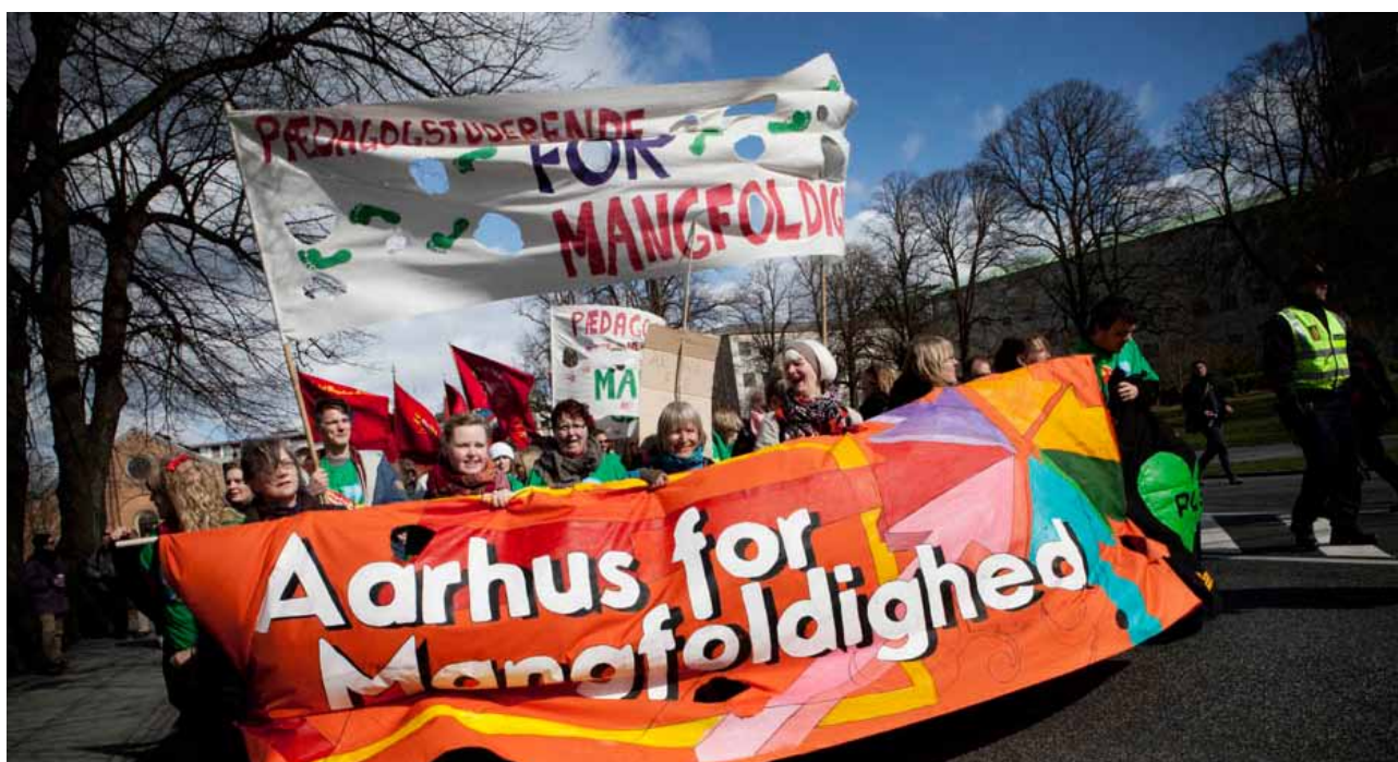
On 30 March 2012, around two hundred members of the Danish and English Defence Leagues held an anti-Islam, anti-multiculturalism rally in Aarhus, the second largest city in Denmark. An estimated five thousand counter-demonstrators gathered under the slogan ‘Aarhus defends diversity’.

The picture of such groups and networks on the