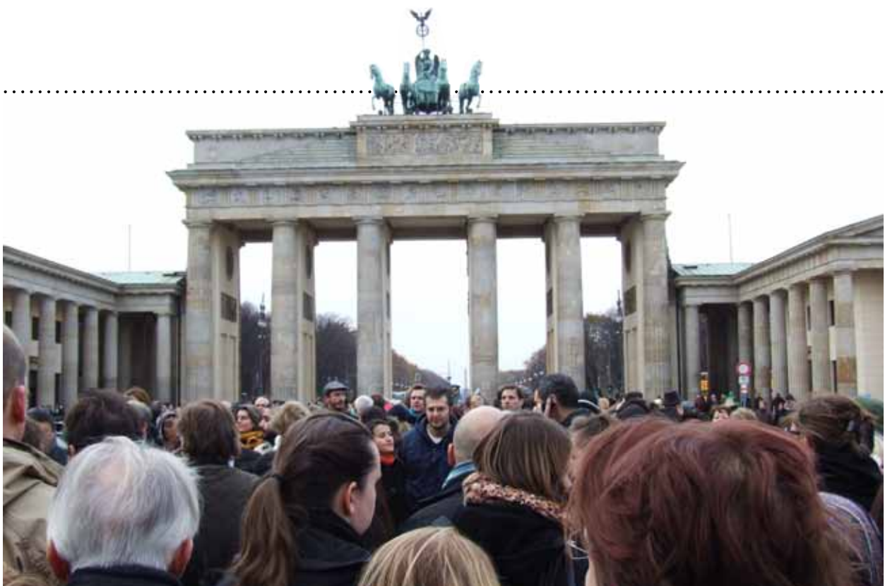
On 26 November 2011, memorial events took place in at least eleven German cities to remember the victims of the National Socialist Underground. The aim of the 'Silence Against Silence' protest was to send a message to the 'silent majority in Germany' that they must do more to oppose racism and fascism.

being a traitor who has embraced multiculturalism. The DDL's motto is 'If you wish for peace, prepare for war'. 34