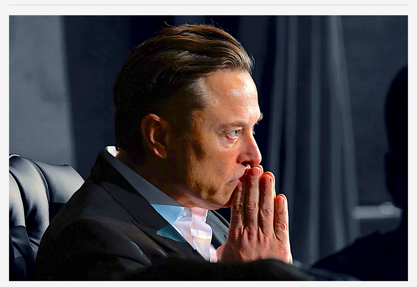
Elon Musk.

Content Warning: This report contains examples of violent hate speech proliferating on Musk's X platform.